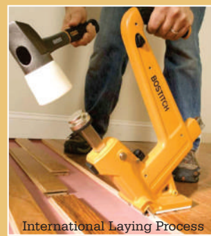
International Laying Process