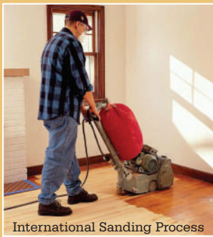
International Sanding Process